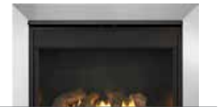
TRIM KIT Available in three or four-sided kits in black or stainless steel.