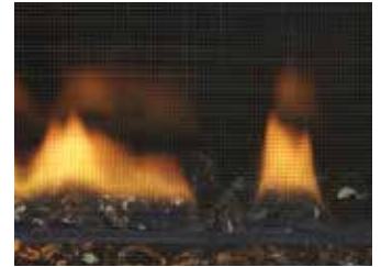
REFLECTIVE GLASS LINER Complement your flame with an optional reflective glass liner.