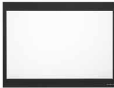
CLEAN FACE KIT Add clean lines and sleek style.