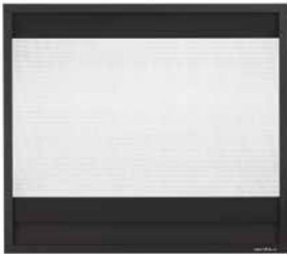
FIRESCREEN Included standard. Available in black only.