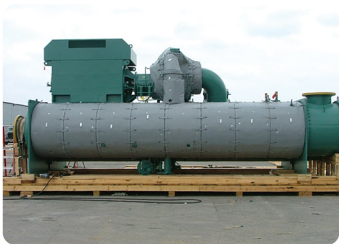
Acoustical Application of Flexin Reusable Insulation Blankets