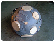
Customized Insulation Blanket Applications

“ WE CAN CUSTOMIZE FLEXIN INSULATION BLANKETS FOR ANY JOB YOU HAVE! ”