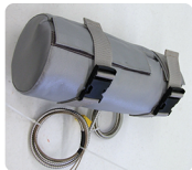
Any Application Large or Small