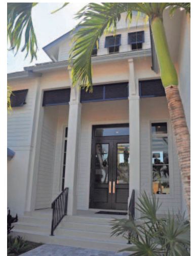
This home by Seagate Development Group is one of only 19 that will be built in the Hill Tide Estates community on Boca Grande.