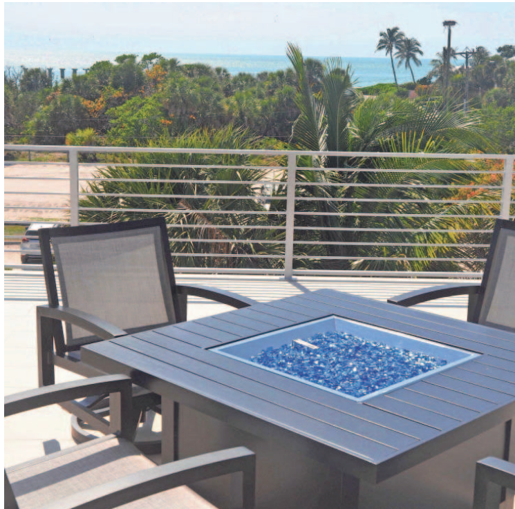
A fire pit area on the second story lanai offers a sitting area with a view of the beach and Gulf.

Three bedroom suites also span the top floor of the Captiva model. Two of the guest rooms have sliders that lead to the