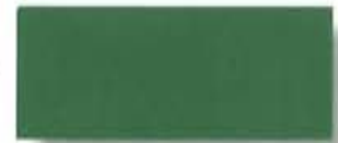
DARK IVY SR 2 R .24 E .83 SRI 21