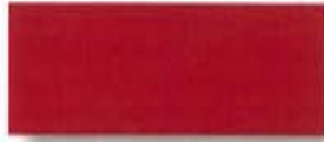
REGAL RED SR R .42 E .84 SRI 45