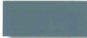
SKY BLUE SR R .29 E .85 SRI 28