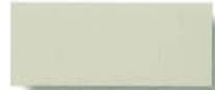
SANDSTONE SR R .51 E .85 SRI 58