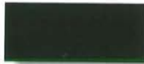
EXTRA DARK BRONZE R .06 E .88 SRI 0