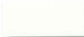
BONE WHITE SR R .70 E .85 SRI 85