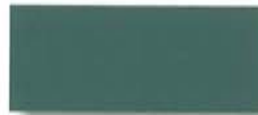
TEAL R .13 E .85 SRI 7