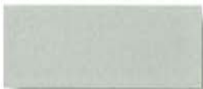
SILVER METALLIC SR★ R .60 E .77 SRI 68