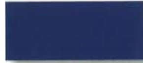
AWARD BLUE ★ R .15 E .84 SRI 9