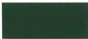
HARTFORD GREEN R .09 E .88 SRI 4