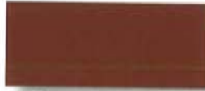
COLONIAL RED SR R .31 E .85 SRI 31