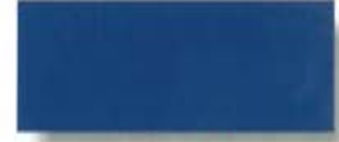
ELECTRIC BLUE ★ R .21 E .88 SRI 19