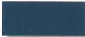
REGAL BLUE R .16 E .86 SRI 12