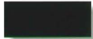
MATTE BLACK SR 1 R .26 E .84 SRI 17