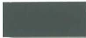
CHARCOAL GRAY SR R .29 E .84 SRI 28