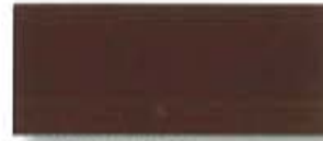
BRANDYWINE SR 2 R .25 E .85 SRI 23