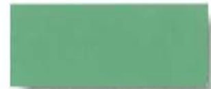
TROPICAL PATINA SR R .28 E .85 SRI 27