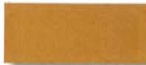
CLASSIC COPPER SR★ R .49 E .86 SRI 56