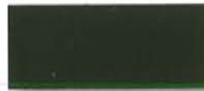
DARK BRONZE SR 1 R .26 E .84 SRI 24