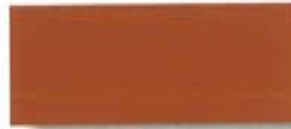
TERRA COTTA SR R .35 E .87 SRI 37