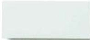
STONE WHITE SR R .60 E .86 SRI 71