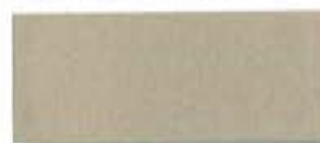
CHAMPAGNE METALLIC SR★ R .37 E .82 SRI 38