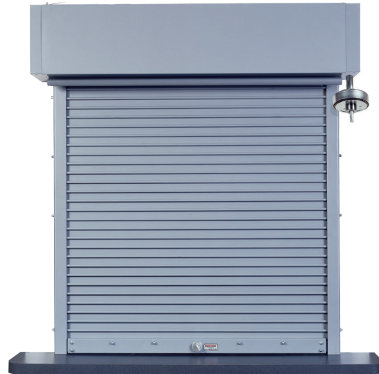
FireCurtain UCP model shown