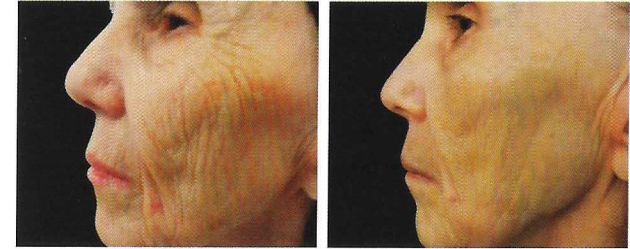
Before and after 4 monthly MicroNeedling treatments using ProCell Therapies Stem Cell Serums.

MicroNeedling with the ProCell pen and serums has resulted in significant improvement in the appearance of wrinkles and acne scarring.