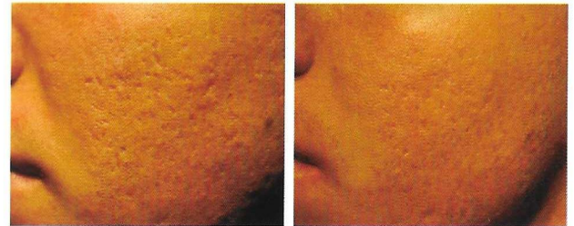
Before and after 2 monthly MicroNeedling treatments using ProCell Therapies Stem Cell Serums.