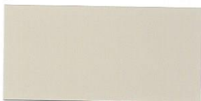
Raffia Beige = 12 ♦