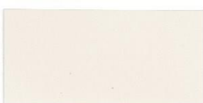
Champagne = 52