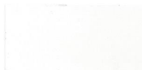
30 White = 01