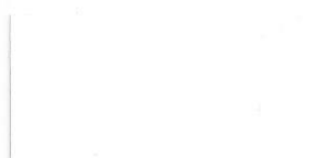
80 White = 03