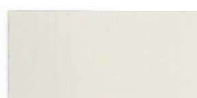
Almond = 10