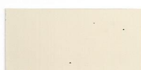
Classic Cream = 44 ♦