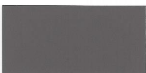
Bronze = 49