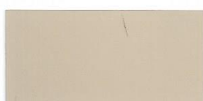
Adobe Tan = 43 ♦