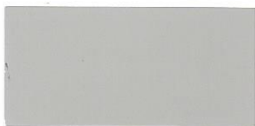
Colonial Gray = 46 ♦