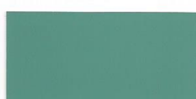
Marine Green = 16