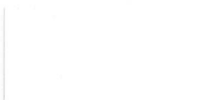
50 White = 02 ♦