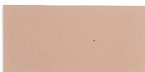
Peach = 50