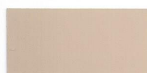
Ivory = 11