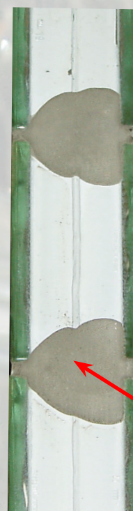
BLOCK-TITE Glass Blocks