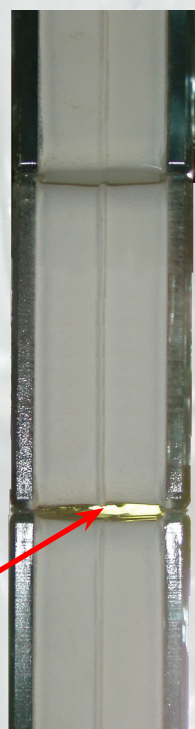
Competitors' Glass Blocks